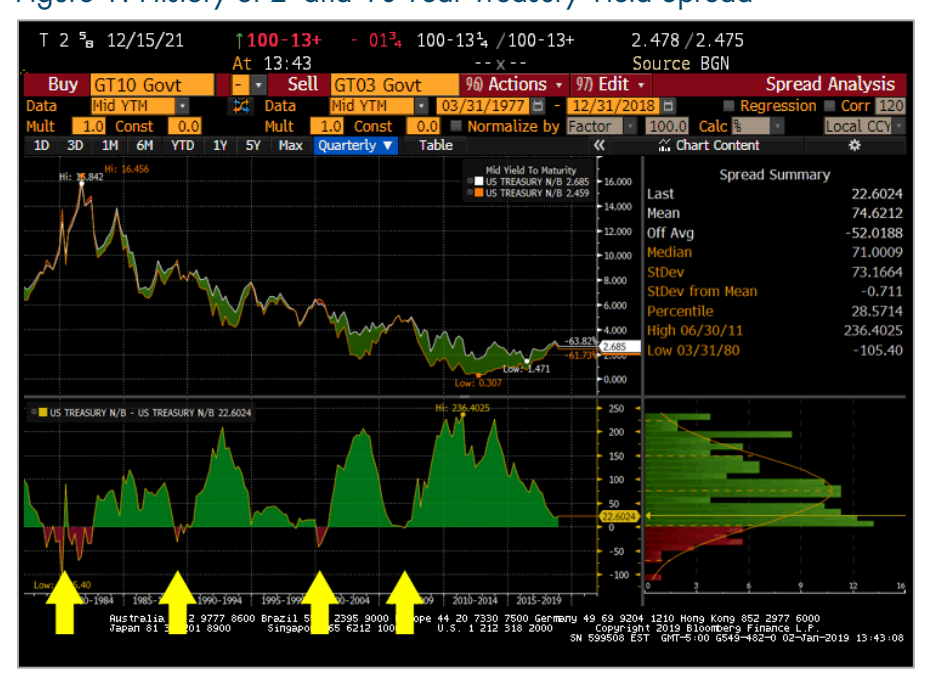
Figure 1: History of 2- and 10-Year Treasury Yield Spread

A partial inversion: For a few days in early December, the market was startled by a "partial inversion," namely an inverted relationship between 2- and 7-year parts of the curve; a "full inversion" refers to the relationship between the 2- and 10-year notes. In the last four decades, each time this has happened, the U.S. economy entered a recession soon afterwards. This makes an inverted curve the most reliable indicator of an impending recession, which explains the market's obsession with it.