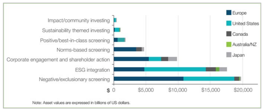
Figure 2: Sustainable Investing by Strategy and Region